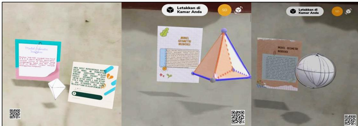
Figure 2. AR Geometry Media Interface